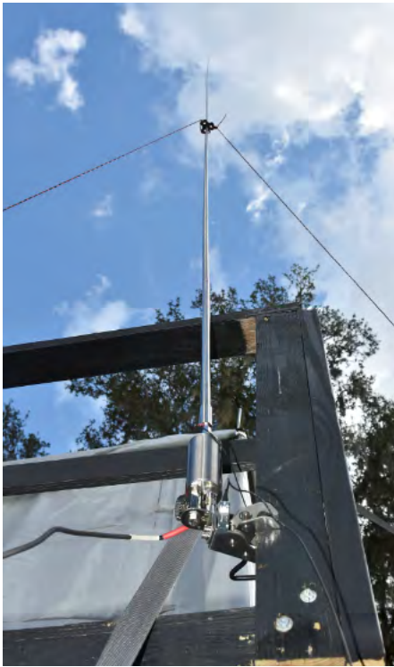
One of three antennas in use.