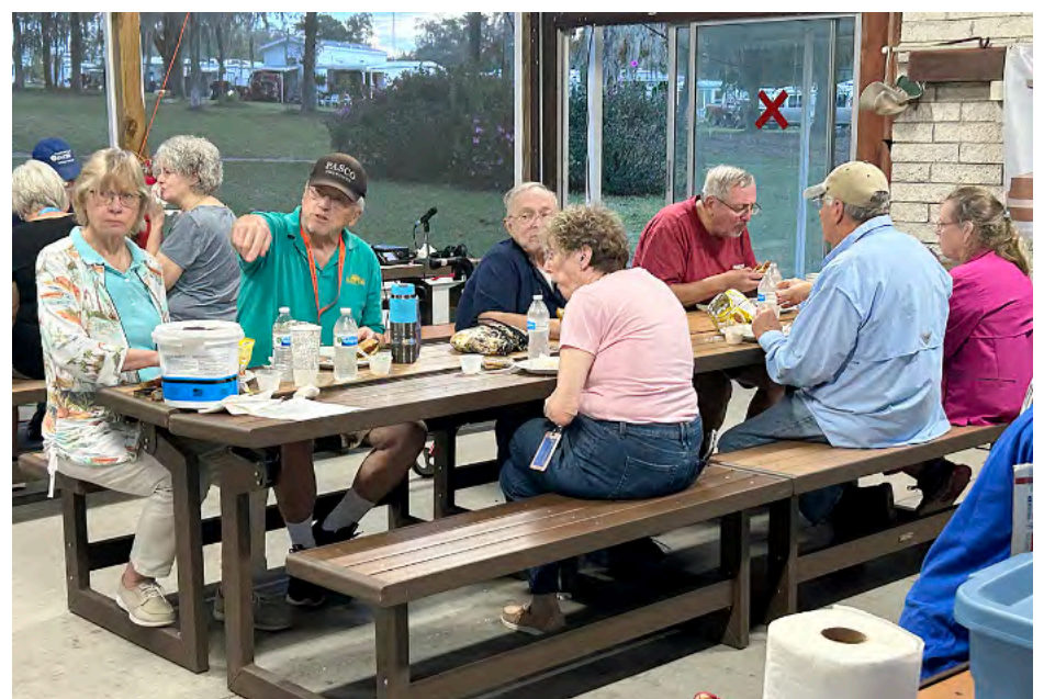
After a hard day of communicating, it's time for a hearty meal.