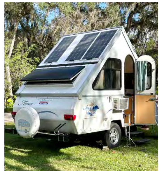
Solar panels on camper provide off-grid power.