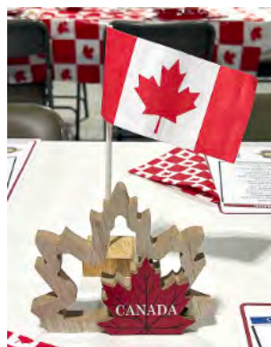
One of the colorful table decorations.