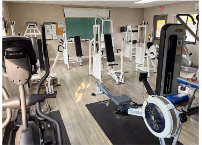
PAUL RUTH FITNESS FACILITY

Once here my formerly lonely existence quickly changed. I was an activity building serving the same purposes as Citrus Center. At one point I ceased housing activities and became the office of the