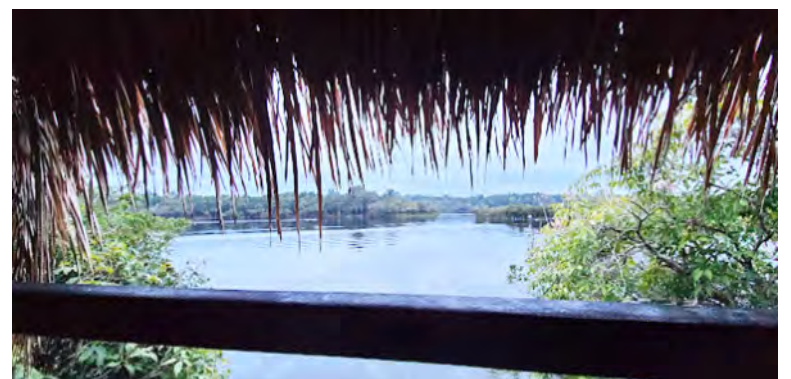
View from the hammock on my porch overlooking the Amazon River.

tribes, some of who remain out of contact and live isolated from the outside world. For more facts you can find them at: https://scientificorigin.com/17-mind-blowing-facts-about-the-amazon-rainforest-ecosystem .