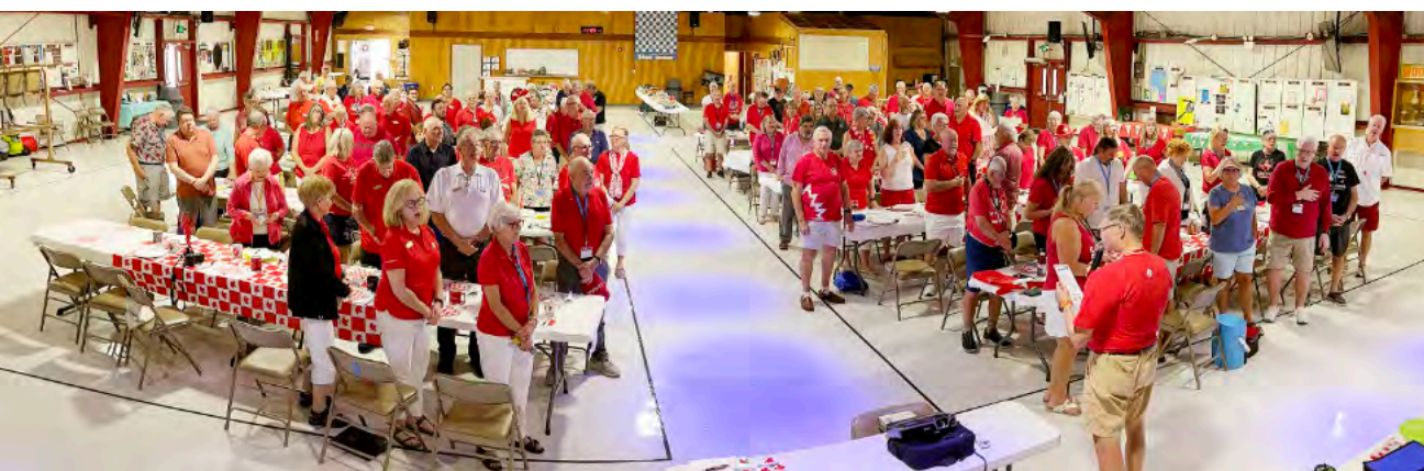
Attendees stand to sing both the American and Canadian National Anthems at the start of the program.