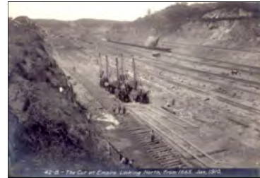
Digging out the main canal January 1910.