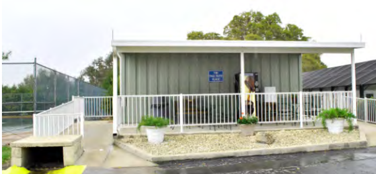
THE PAUL RUTH PLACE