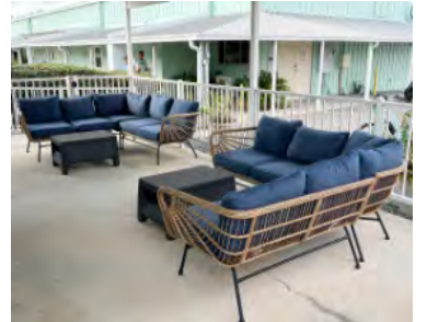
The Paul Ruth porch is a cozy place to gather with your friends.

behind and become part of this active new family.