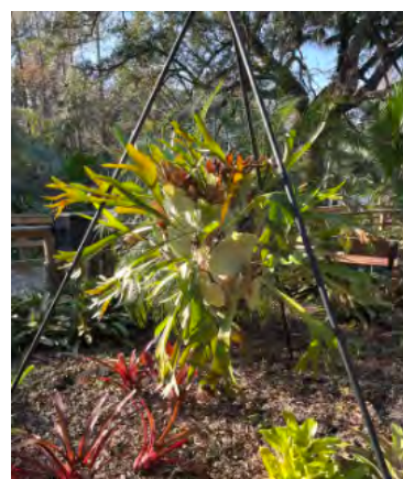
A tripod was erected to support this staghorn fern.

Sunday, March 9 is the Annual Art in the Garden Walk.