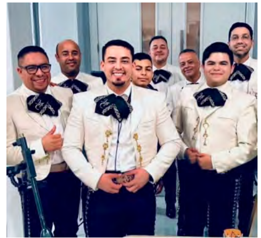
MARIACHI CONTEMPORANEO