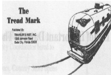
"The Tread Mark" original logo.