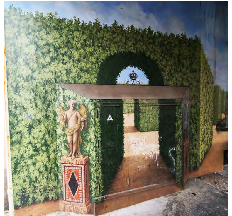
A mural under a portico in the city.