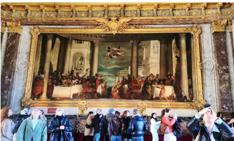
One of the many murals in the palace of Versailles.

Side note: Louis XIV encouraged the arts during his reign to preserve the history of France.