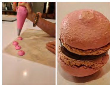
Learning to make the perfect macaron.