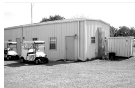
The Ruth Howes Room located at the rear of the Fire Station and Paul Rife Room complex. This space, just 28' x 20', is where it all takes place with the exception of the actual printing.