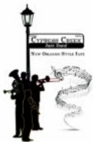
Nov. 1 – Cypress Creek Jazz Band brings their Dixieland jazz