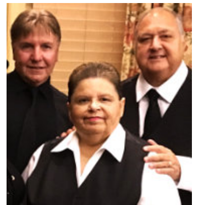
Dec. 27 – Ring out the Old, Ring in the New with Past Tense , a local trio bringing you the best songs of the 50s, 60s and 70s. Guaranteed to set your feet tapping!