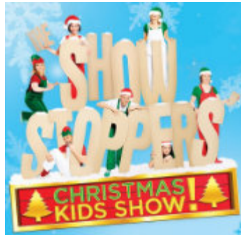
Dec. 13 – Showstoppers Christmas Show is a beloved program penciled in on our schedule – it is a children's troupe, so we are being extra careful – keep your fingers crossed that all goes well and we can enjoy their wonderful show again this year!